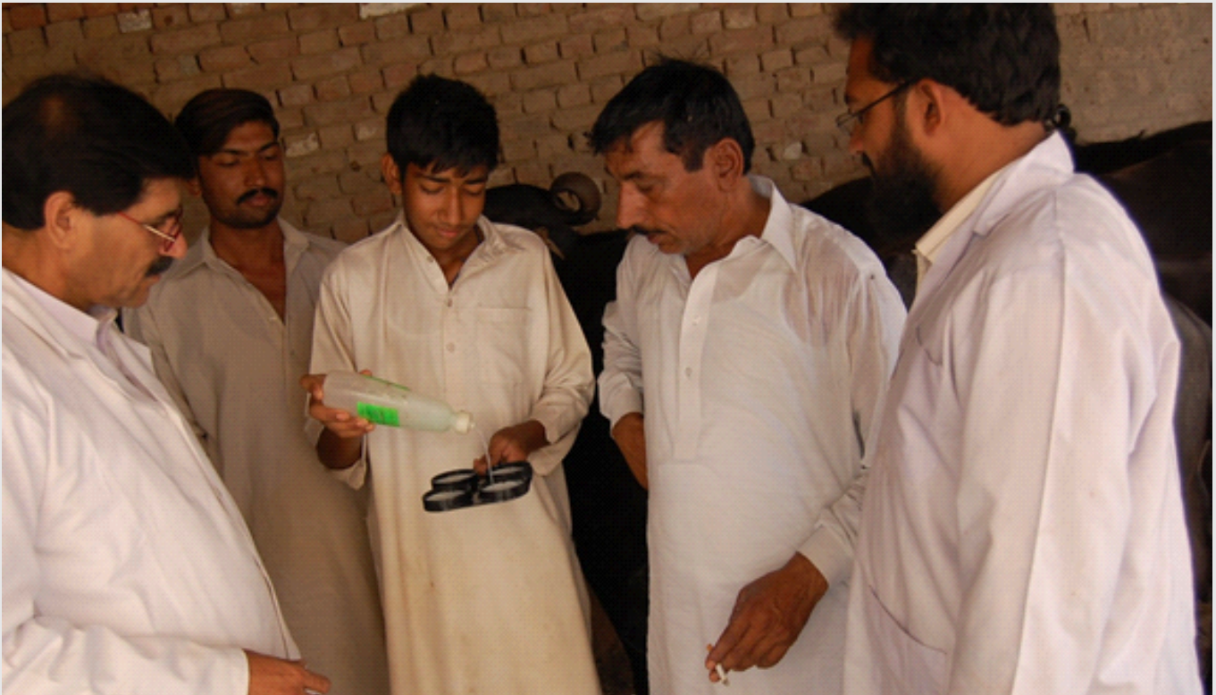
A youth being trained in the execution of Surf Field Mastitis Test for diagnosis of sub-clinical (hidden) mastitis