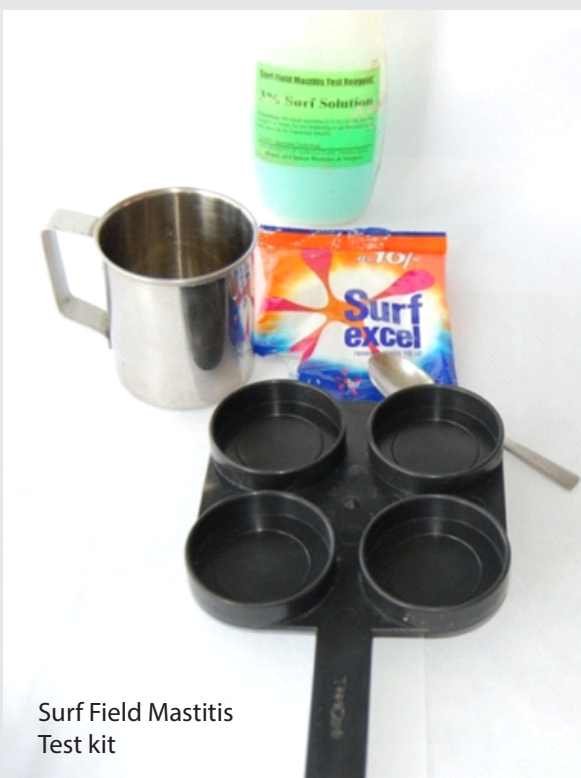
Surf Field Mastitis Test kit